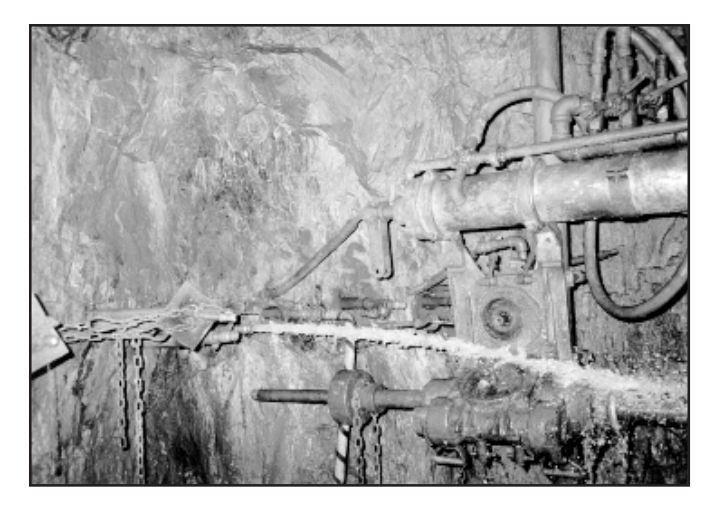
Underground drill hole showing the result of intersecting water-bearing fractures at a depth of 500 feet below surface; water pressure testing established that rock fissures were very narrow, thus justifying the use of microfine cement grout