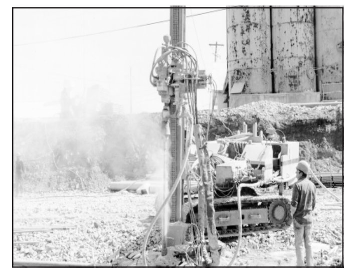
FIGURE 2 - DK 100 Drill Rig in Operation

Figure 2 shows the DK 100 drill rig drilling into limestone after the casing has been installed through overburden.