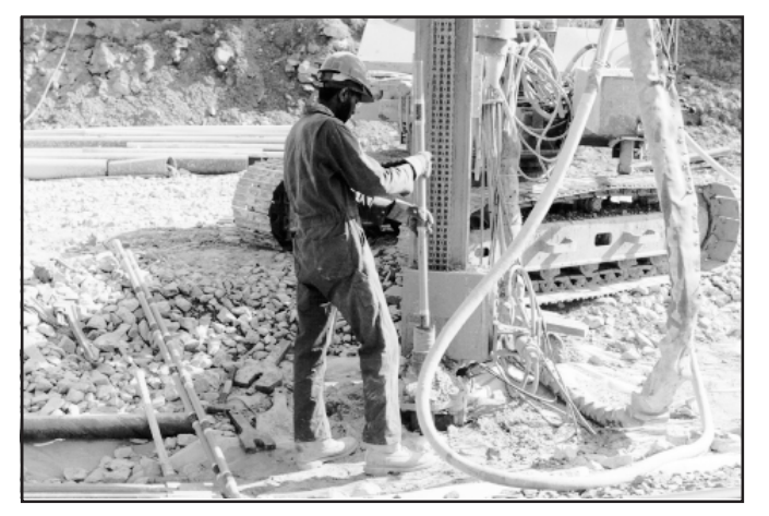
FIGURE 3 - Plastic Sleeve Pipes Being Installed

It was deemed inappropriate to create a dense, high-strength grout, which is frequently required on other grouting projects. Specifically for this site, the principal requirement was only to stabilize the soil sufficiently to allow the large Barber drill rig to be operated safely on the job site without sinkholes being created.