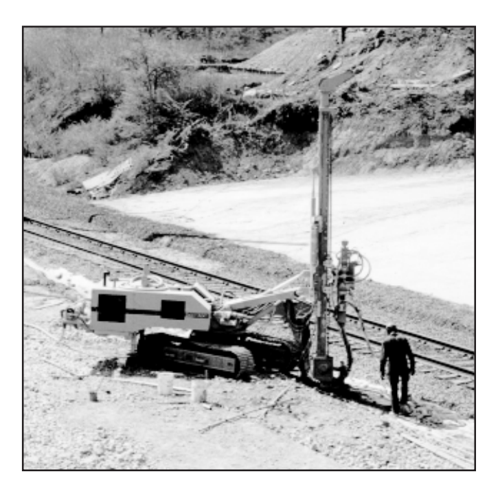
FIGURE 1 - Project Site Looking North

A Davey-Kent DK 100 crawler-mounted drill rig was used for drilling probe holes for site evaluation and grouting purposes. This drill rig enabled the concurrent driving of a drill string and external casing through overburden and unconsolidated ground. After the casing had been seated into competent rock, the drill string was used to complete drilling operations in a conventional manner.