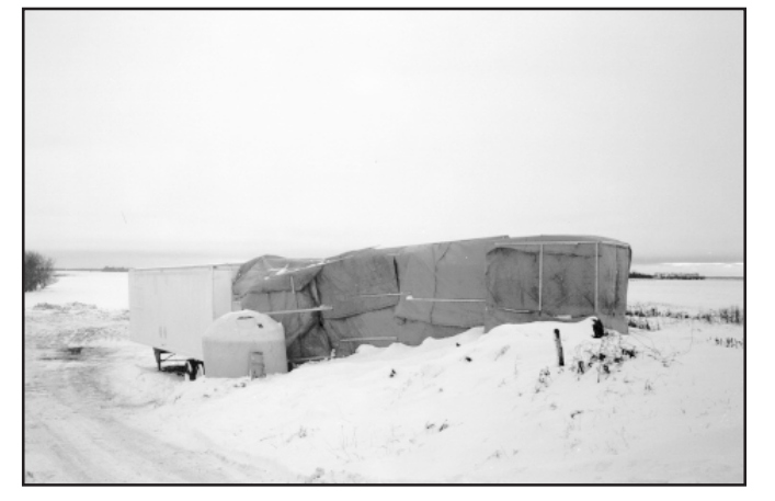
At this cold weather job site, grouting crews were protected from the elements utilizing heated vans and tarps