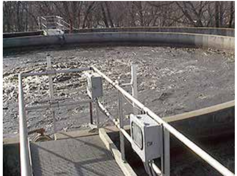
CJ-1020 is a commonly used waterstop for floor-to-wall construction joints on water tanks

Hydrotite is intended for use in fresh water environments with small amounts of contaminants. Specific site testing is required in areas with concentrated chemicals, processing fluids and brines.